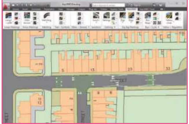
CALMING FEATURES DRAWN ONTO A PLAN

You can automatically generate a 3D drivers eye to use as a safety audit tool and for realistic consultation presentations. As your drawing takes shape, KeyLINES Eire allows you to label and calculate quantities of each marking in your design before estimating costs.